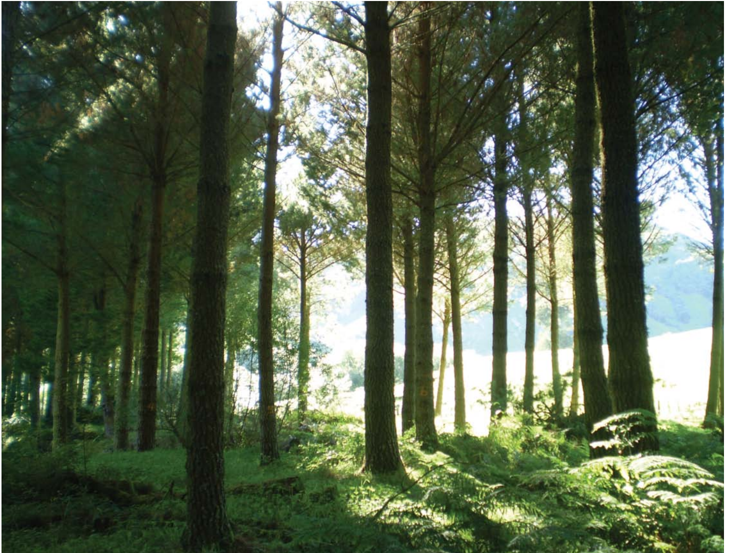
Greenplan (Tin Whare 1996) Forest Partnership No.26

Third lift pruning continues in Partnership 57 Greatwood, plotting data collected has provided excellent results to date. Progress is reasonably slow at the moment due to a change in contractors but we expect things will improve once the crew familiarises themselves with our Job Prescription.